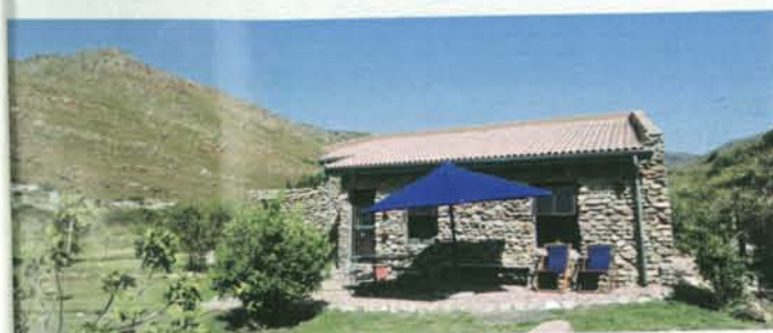
ABOVE LEFT: Cool off in clear pools in the Witte River on Bastiaansklouf estate after a hike. RIGHT: Kraal Cottage is a romantic love nest made for two.