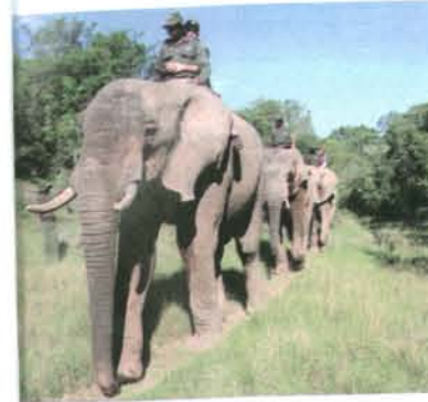
An elephant-back safari gives you a different perspective on the world.

Thaba, Duma and Mokhwa, the bull elephants at Addo Elephant Back Safari and Lodge, moved slowly through the bushveld, grabbing large helpings of the thorny trees, not caring that the branches might swing back and scratch me. Thanks to my thick pair of jeans and knee-high leather boots, my legs survived. It's fascinating to see how the large creatures follow each other and trust their keepers.