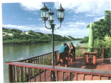
At Dungbeetle River Lodge, you can have breakfast on the wooden deck that overlooks the Sundays River.

For those not keen on water activities, there are bicycles, birding opportunities and